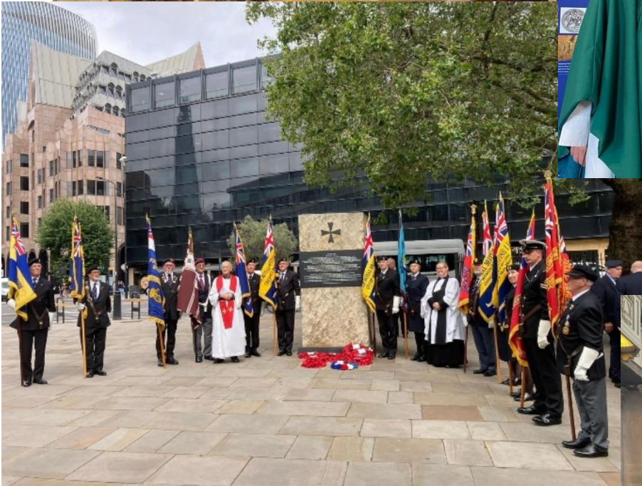
The George Cross Foundation Malta Memorial service in August.