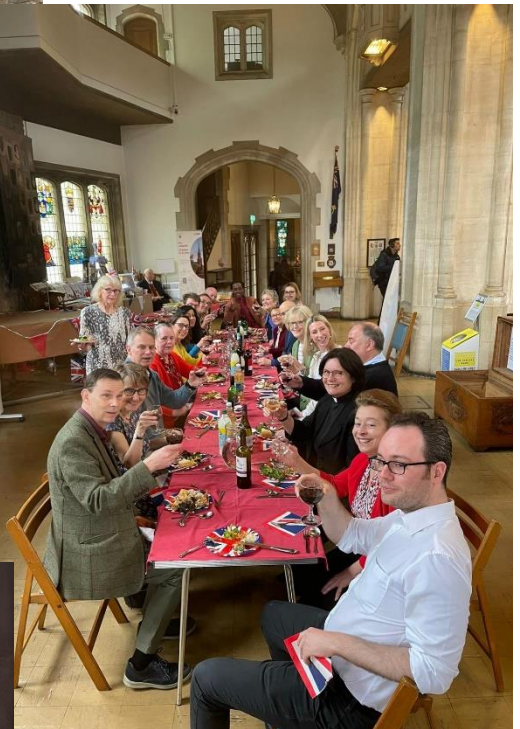
A parish lunch for the Coronation of King Charles III.