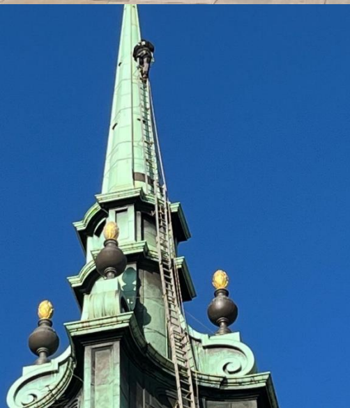
Steeplejacks climbing the spire to make repairs to the weathervane!