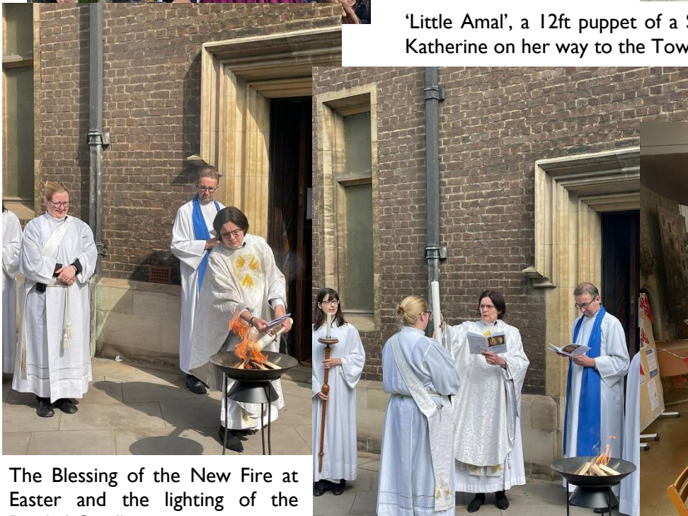
The Blessing of the New Fire at Easter and the lighting of the Paschal Candle.