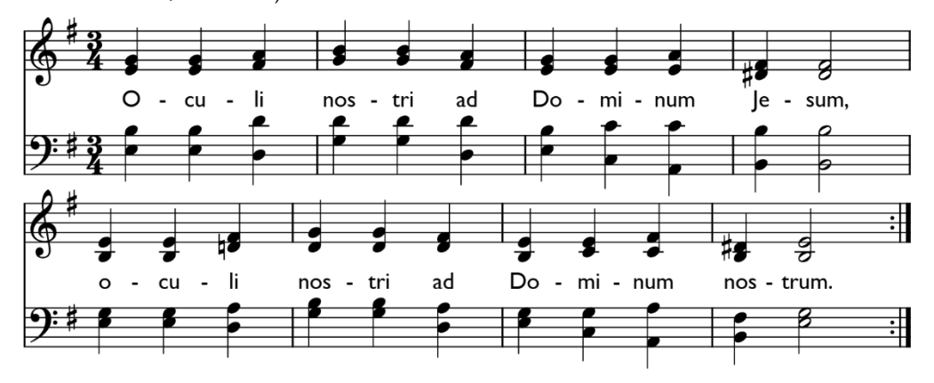
Chant 2 Oculi nostri (Our eyes are turned to the Lord Jesus Christ. — Our eyes are turned to the Lord God, our Savior)