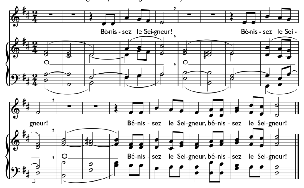
Chant 6 Bénissez le Seigneur (Let us sing to the Lord!)

Please stay as long as you wish for silent prayer.