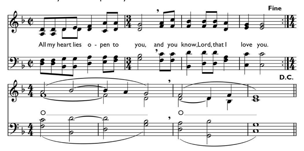
Chant 2 All my heart lies open to you