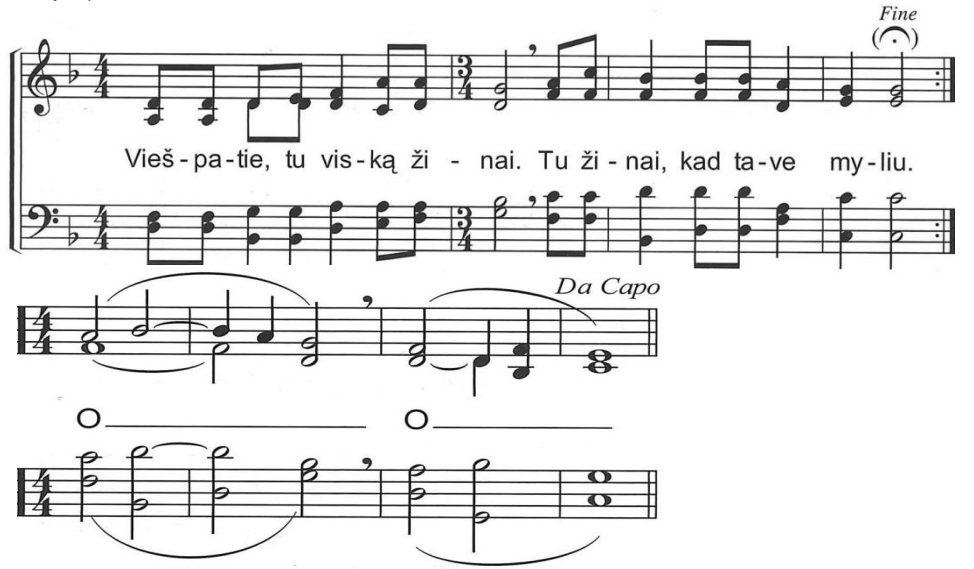
Chant 5 Viešpatie, tu viską žinai (All my heart lies open to you, and you know, Lord, that I love you)

Our Father, who art in heaven, hallowed be thy name; thy kingdom come; thy will be done; on earth as it is in heaven. Give us this day our daily bread. And forgive us our trespasses, as we forgive those who trespass against us. And lead us not into temptation; but deliver us from evil. For thine is the kingdom, the power, and the glory for ever and ever. Amen.