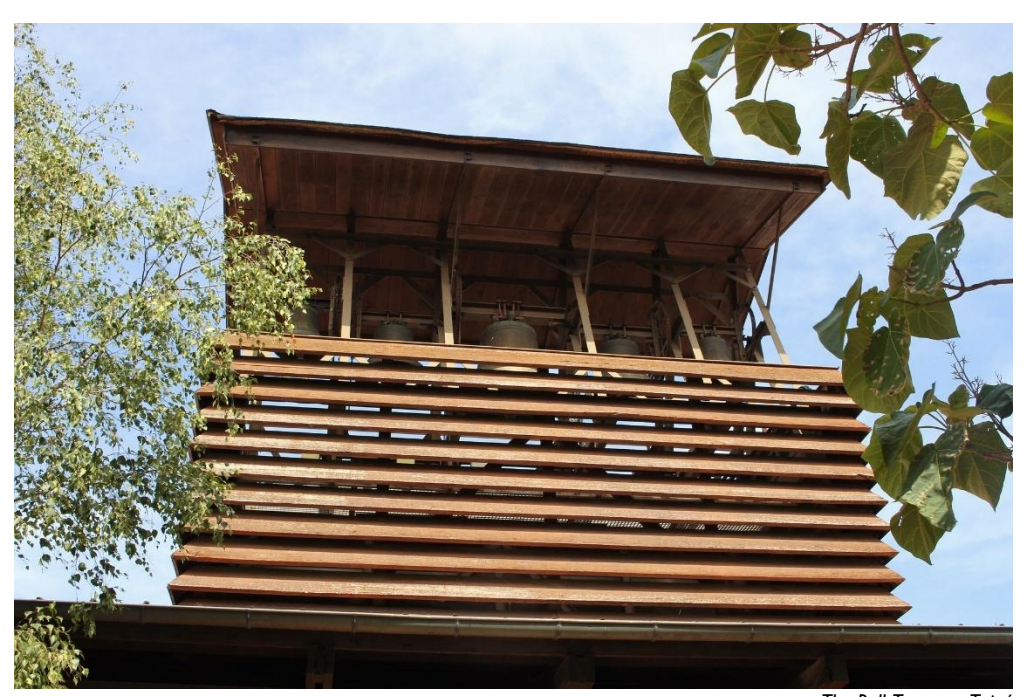
The Bell Tower at Taizé