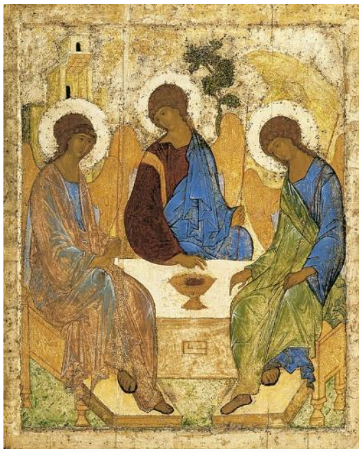
The Hospitality of Abraham by Andrei Rublev