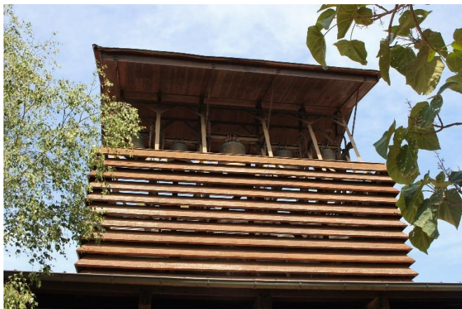
The Bells at Taizé